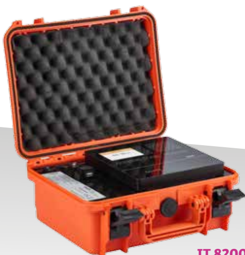
IT 8200 PORTABLE

VINCI Facilities were in charge of all Hard and soft facilities management services to support the event including cleaning and waste management