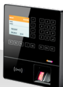
IT 8200 FP