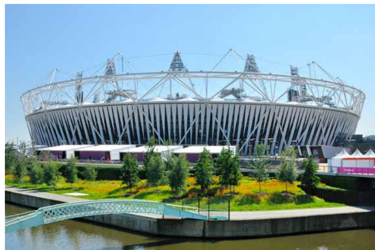
Olympic Stadium in London